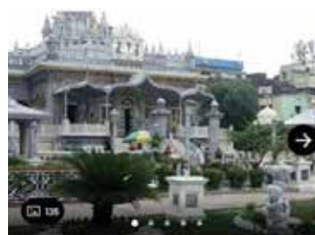
Parasnath Temple, Belgachia