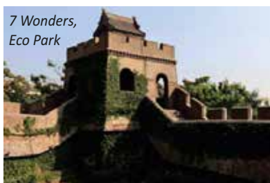
Great Wall of China