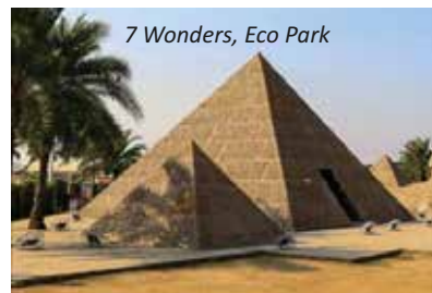
Pyramid of Giza