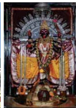
Ramkrishna Kali Dakshineswar