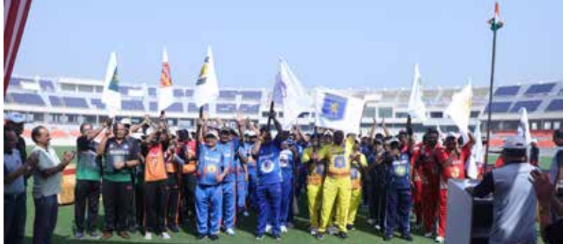
Cricket Teams marching alongwith their team flag.