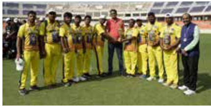
Southern Zone Team – Runner Up of 1st APL.