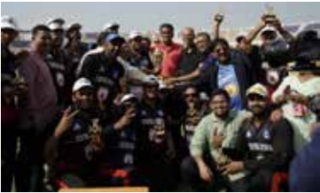
Central Zone Team - Winner of 1st APL.