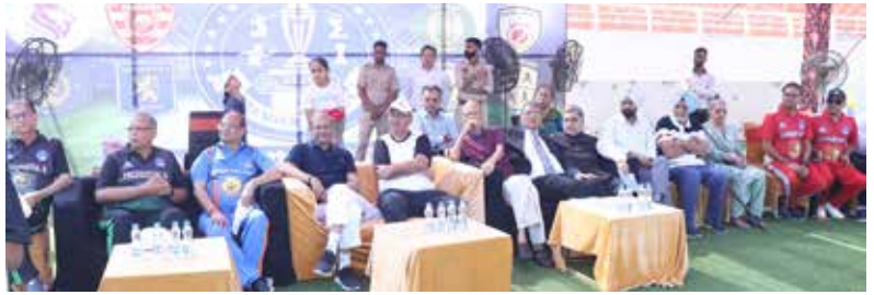
Chief Guest alongwith Office Bearers.