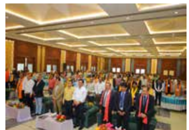
Section of Audience