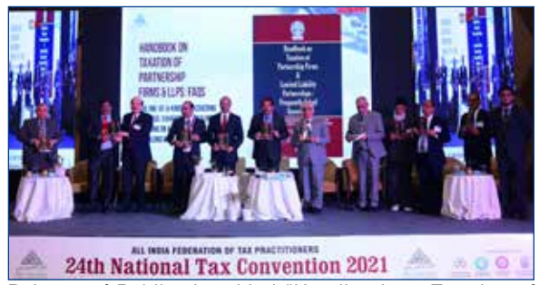
Release of Publication titled "Handbook on Taxation of Partnership Firms & LLP : FAQs".