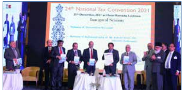
Release of "Glimpses of 45th Foundation Day Celebration" and "Calendar 2022" of AIFTP.