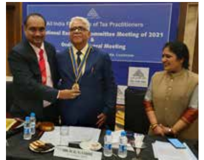
Change of the Guard for National President at 1st NEC for the term 2022