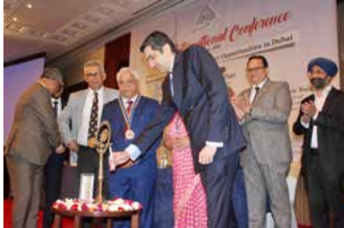
Hon'ble Dr. Aman Puri, Consul General of India, Dubai inaugurating the Conference by lighting the lamp as Chief Guest.