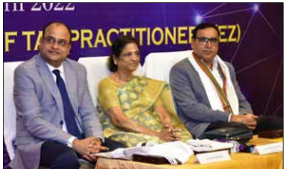
2nd Technical Session on Reassessment - Present Scenario u/s. 148 & 148A of Income Tax Act & Its Implication After Hon'ble High Court Orders