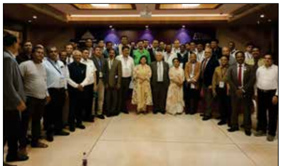
Team of Bhubaneswar alongwith National President, A.I.F.T.P. and other Office Bearers