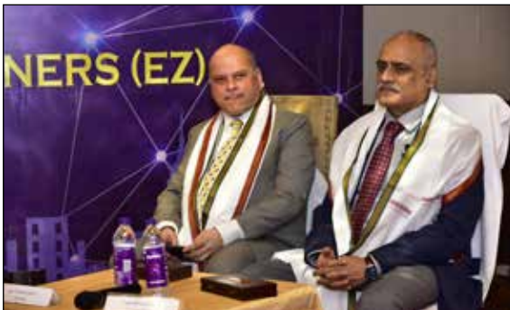
1st Technical Session on Draconian Provisions of Attachment Under GST and its Remedies