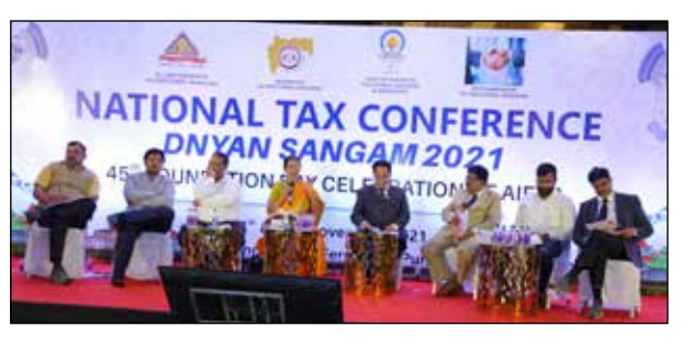
Tax Ki Dangal on Real Controversies in Real Estate Industry in Taxation.