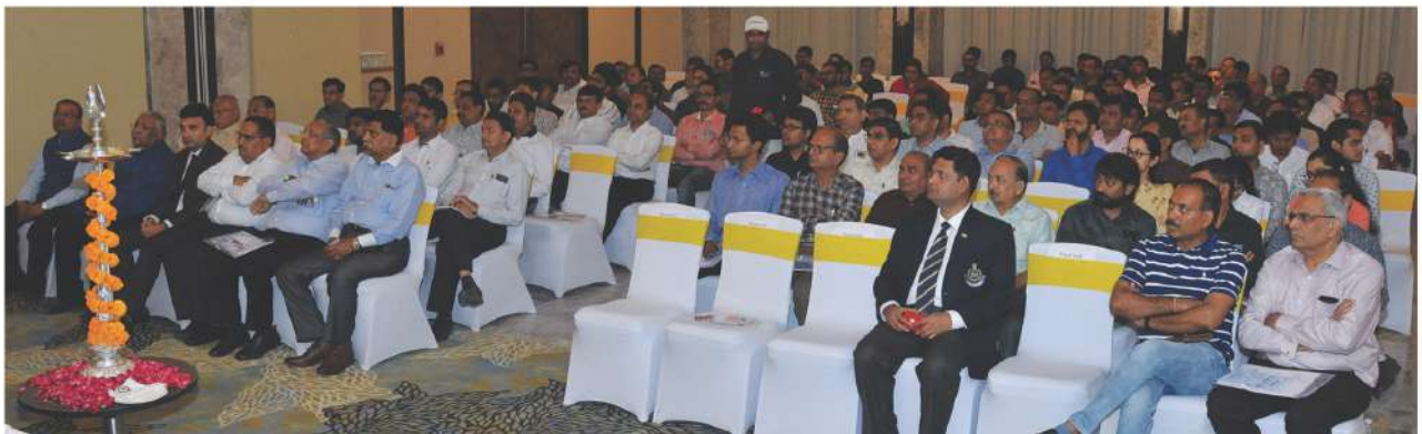
Section of Audience