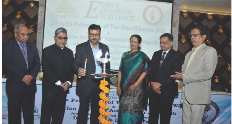
Shri Neeraj Jain, IRS, Hon'ble Principal CIT, inaugurating the conference