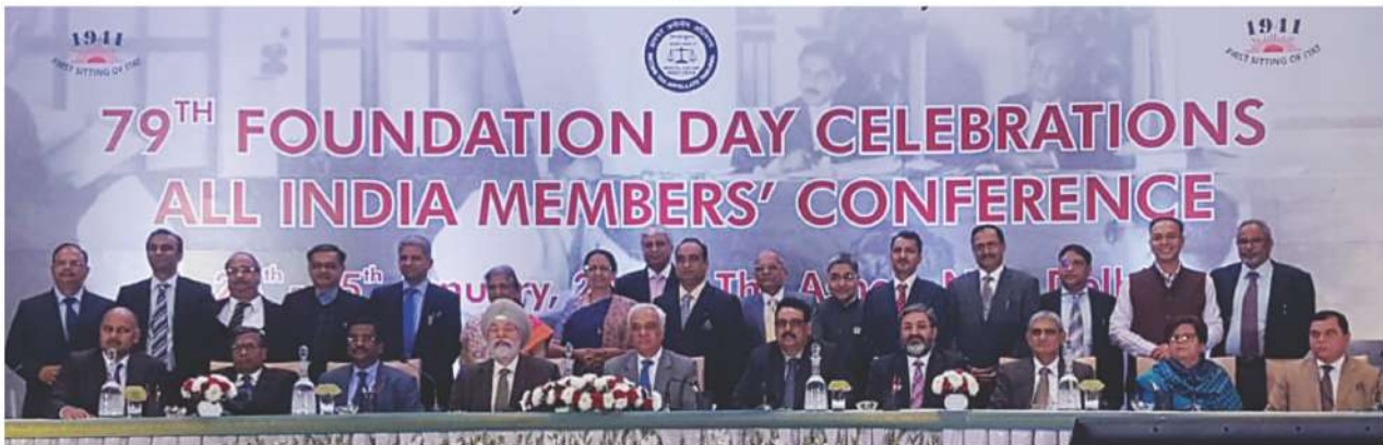
Team of AIFTP along with Hon'ble President and Vice Presidents of ITAT on 25th January, 2020