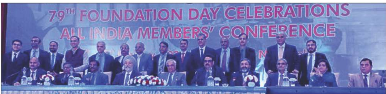
Team of ITAT Bar Association, Mumbai along with Hon'ble President and Vice President of ITAT on 25th January, 2020