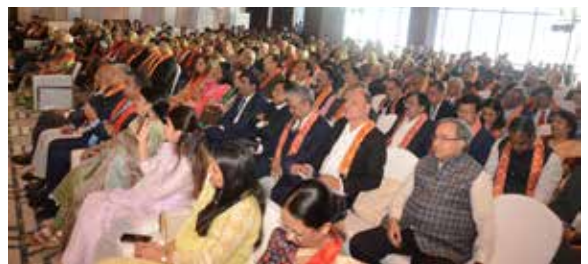
Audience in Convention Banquet