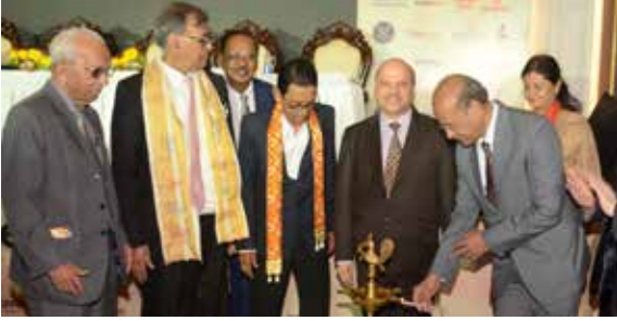
Inauguration of Convention by Justice Rajesh Bindal