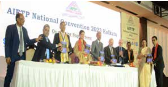
Justice Bindal releasing the Book on Law of Evidence & Cross Examination