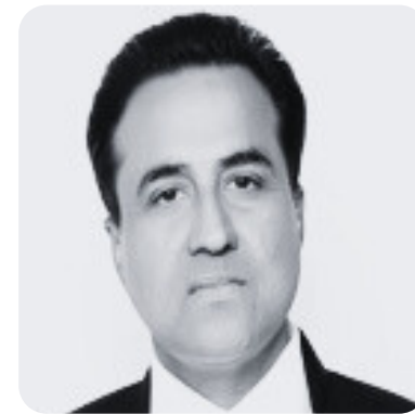
Guest of Honour Hon'ble Mr. Justice Arun Palli Judge, Punjab & Haryana High Court