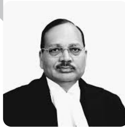
Chief Guest Hon'ble Mr. Justice Surya Kant Judge, Supreme Court