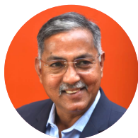
CA G B Modi Dhule Topic : MSME Role of Tax Professionals & CA