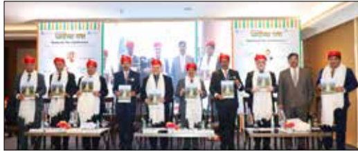
Release of Souvenir.