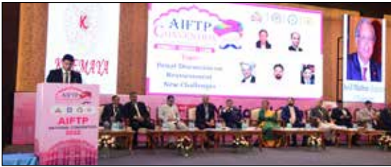
Third Technical Session on "Reassessment – New Challenges"