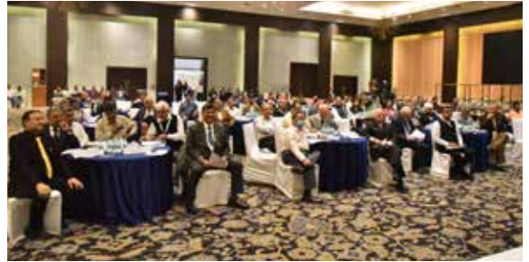
Office Bearers and National Executive Committee Members.