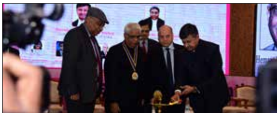
Hon'ble Mr. Justice Ajay Rastogi, Judge, Supreme Court of India inaugurating the Convention by lighting of lamp.