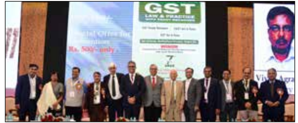
Second Technical Session on "Input Tax Credit – Controversial Issues"