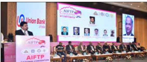
Brains' Trust Session and Valedictory Session.