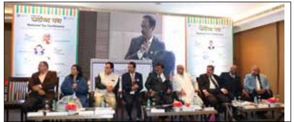
Brains' Trust Session.