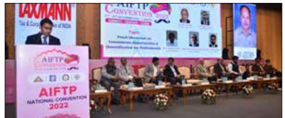
Sixth Technical Session on "Investments Opportunities & Diversification for Professionals"