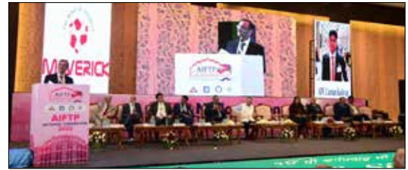
Fourth Technical Session on "Start-ups – Opportunities & Future"