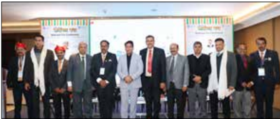
Third Technical Session on "Intricacies in ITC under GST"