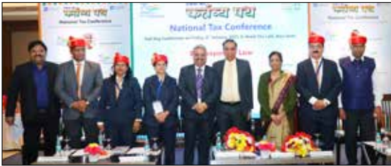
First Technical Session on "Succession Planning including Wills, HUF, Nomination and Trust".