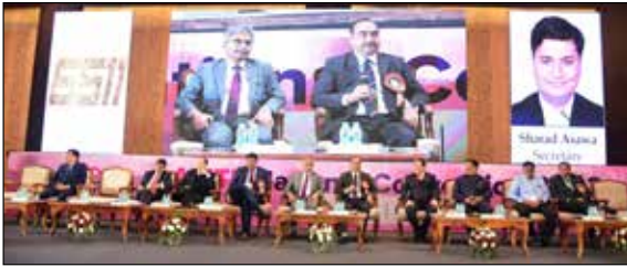
First Technical Session on "Issues under Economic Offences – PMLA, FEMA, etc. – Precautions and Remedies".