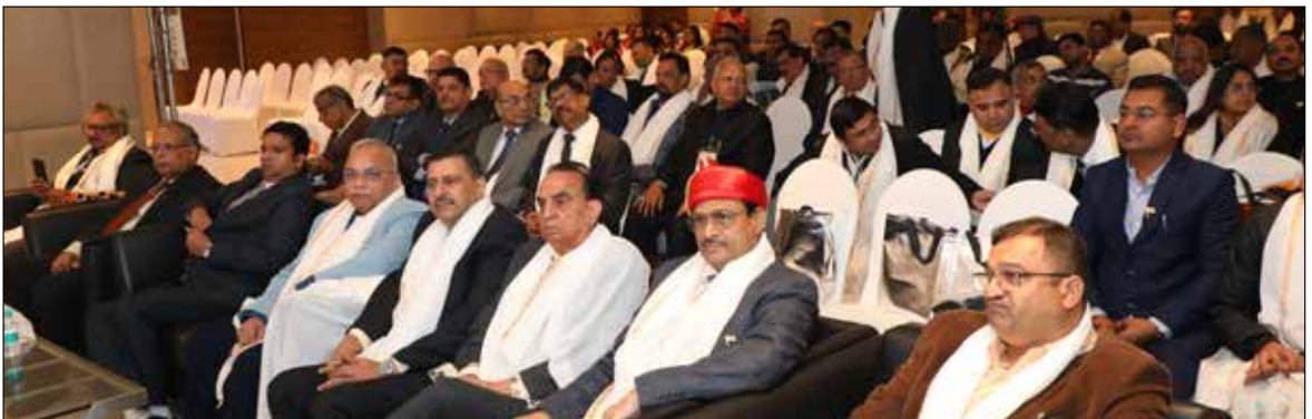
Section of Audience.