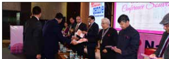
Release of Convention Souvenir.