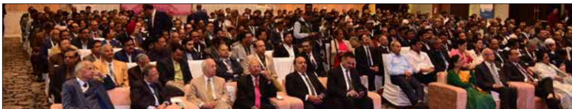
Section of Audience.