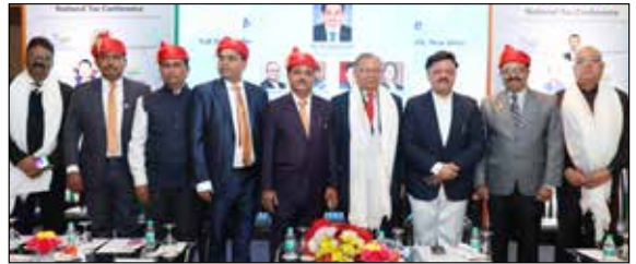
Second Technical Session on "Interpretation of Drafts and Deeds".