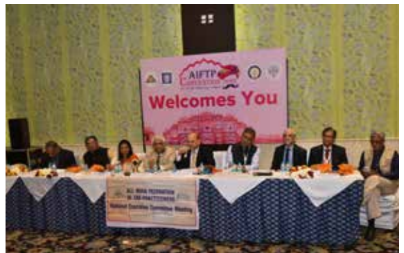
Outgoing Office Bearers and Incoming Office Bearers.