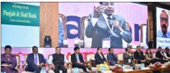
Fifth Technical Session on "Search, Summon & Arrest under GST"