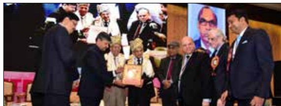
Release of AIFTP's publication on "Search seizure, Survey, Prosecution and Arrest under Tax and Allied laws - Frequently asked questions"