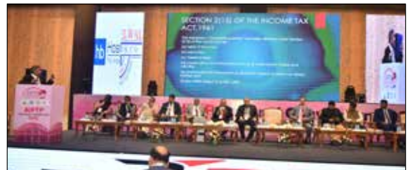
Seventh Technical Session on "Trust and NGO – Restrictions, Compliance and Judicial views"