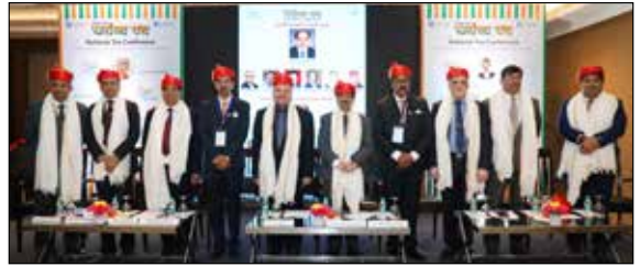
Dignitaries at the Inaugural Session.