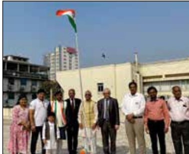
Mumbai (Head Office)