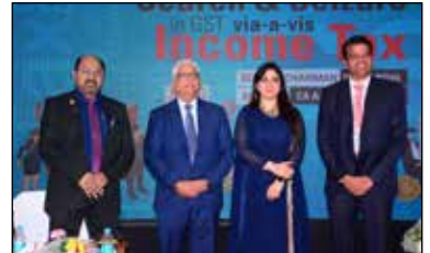
Dignitaries at the Conference