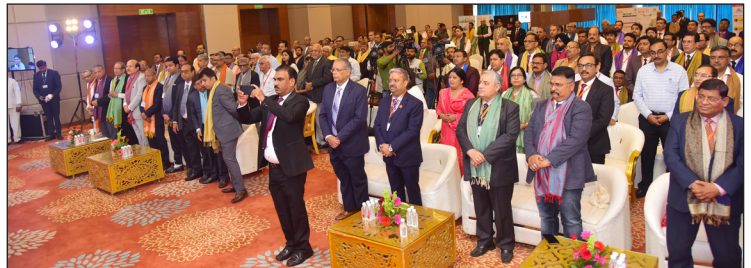
Section of Audience.