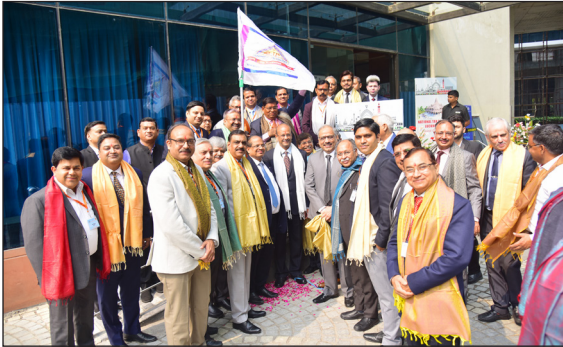
AIFTP's Flag hoisting by Hon'ble Mr. Justice Rajesh Bindal, Judge, Supreme Court of India alongwith other Hon'ble Judges, Office Bearers and Members.