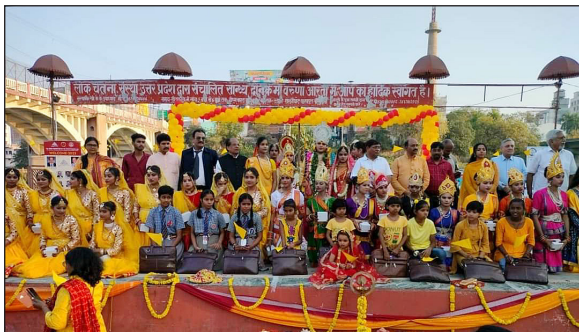
CSR Activity jointly with Maharashtra Tax Practitioners Association, Pune at Shastri Ghat, Varanasi organised by AIFTP (NZ) on 22-3-23 by Honour Poor and Needy Scholar Students.