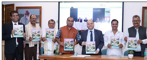
Release of Souvenir