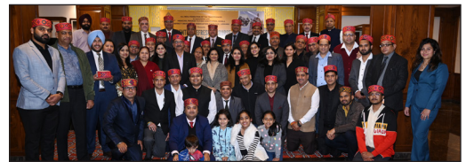
Participants at RRC