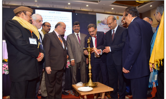
Hon'ble Mr. Justice Rajesh Bindal, Judge, Supreme Court of India inaugurating the conference by lighting of lamp.