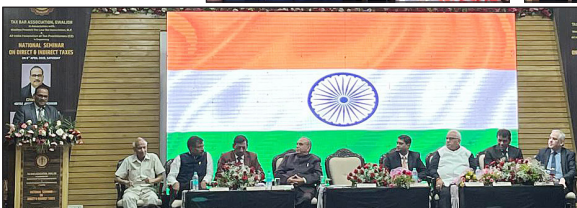
National Seminar on Direct and Indirect Taxes organised by AIFTP (CZ) in association with Tax Bar Association, Gwalior, Madhya Pradesh Tax Law Bar Association, MP. at Gwalior on 8-4-2023 .