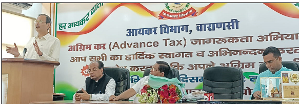
Farewell function of Chief Commissioner of Income Tax, Prayagraj at Varanasi organised by AIFTP (NZ) on 25-3-2023 .