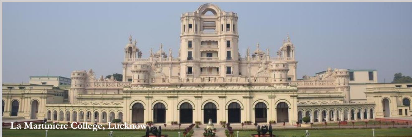
La Martiniere College, Lucknow

Free Pick up & Drop by car facility will be available to all delegates between Amausi Metro Station & Ramada Hotel.